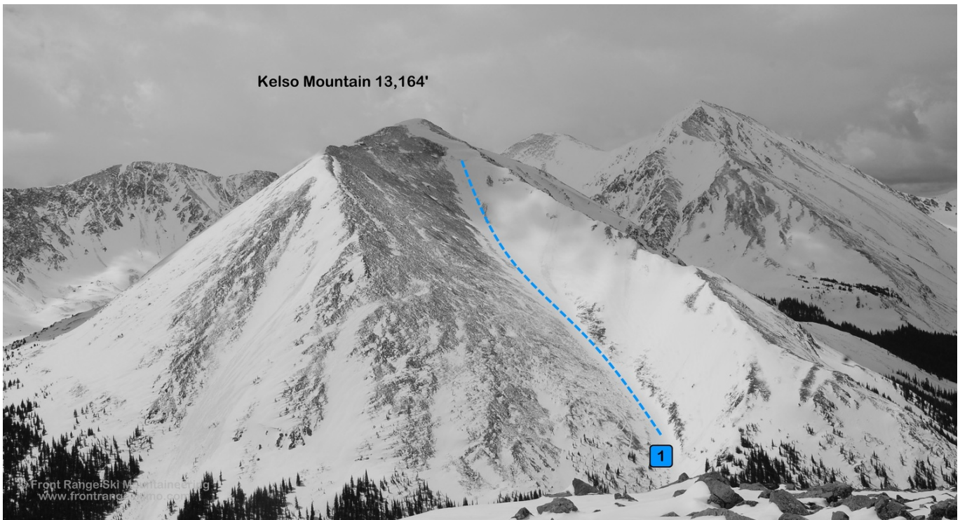
Kelso Mountain from the north.

Kelso Mountain is the gateway to the Stevens Gulch and Grizzly Gulch ski mountaineering arena. Kelso is positioned in the middle of these two major gulches and the summit provides climbers and skiers with stunning views that will provide inspiration for future adventures. The North Gully on Kelso is one of the more frequently skied routes on the Front Range. This peak is positioned close to Interstate 70 and the approach can be quick, but be prepared for a big climb of over 2,000 feet to the summit! The north side of Kelso including the North Gully is on private land, but access in the winter and spring has not been an issue to date.