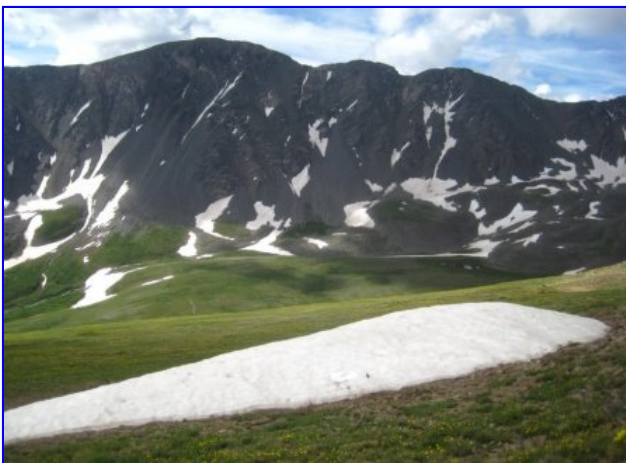
A mound of snow and mountains.