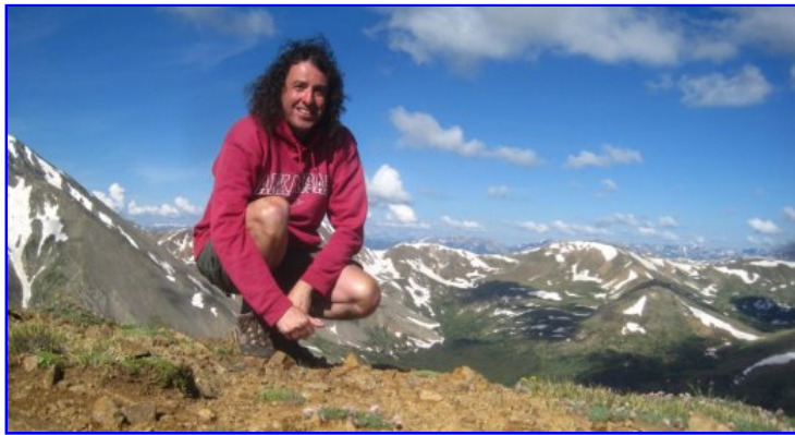
A picture of me that I actually like. :)