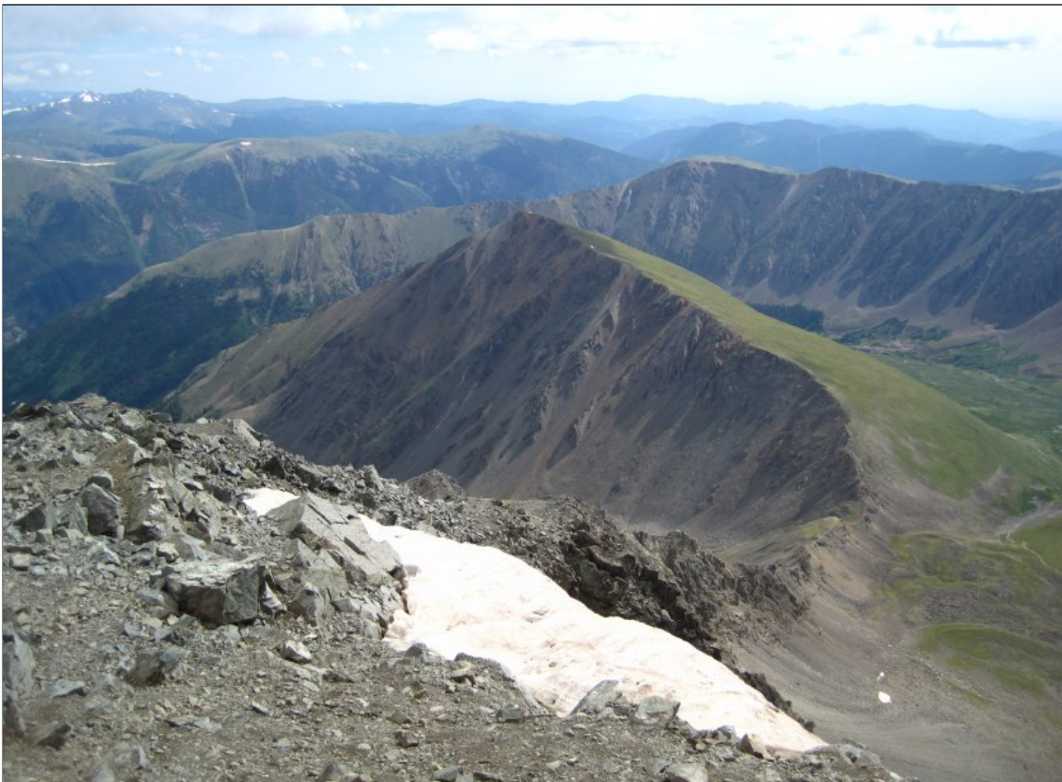
The view of Kelso Mountain from Torreys Peak.

NOTICE: As of July 13, 2014, Stevens Gulch Road up has one terrible spot where only a 4WD vehicle with some high clearance will get you through. (Three years ago I drove my Honda Civic all the way to the trailhead, but not today.)