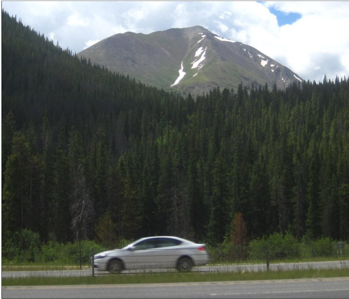
Facing Kelso Mountain from Interstate 70 at Bakerville. (Exit 221)

in Buena Vista, Colorado. Facebook - Twitter - Pinterest - YouTube